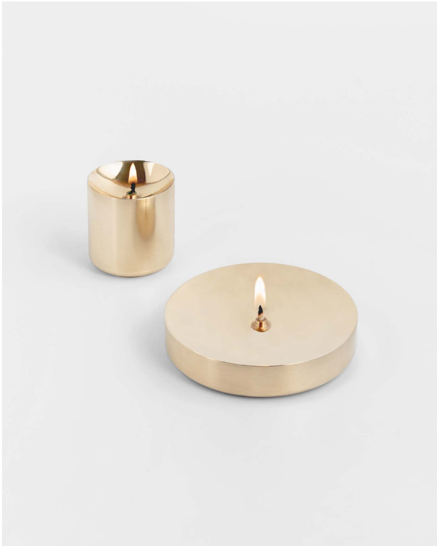
left: Dīpā tall, right: Dīpā wide