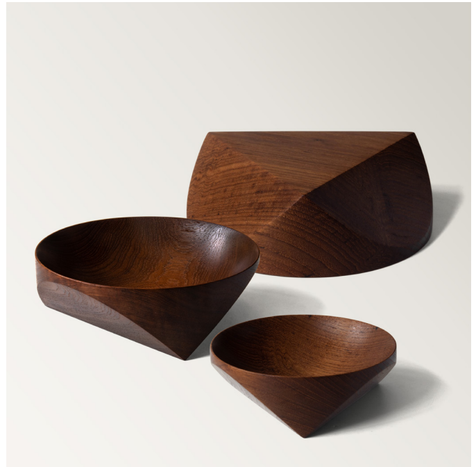
bottom: 150mm teak, middle: 200mm teak