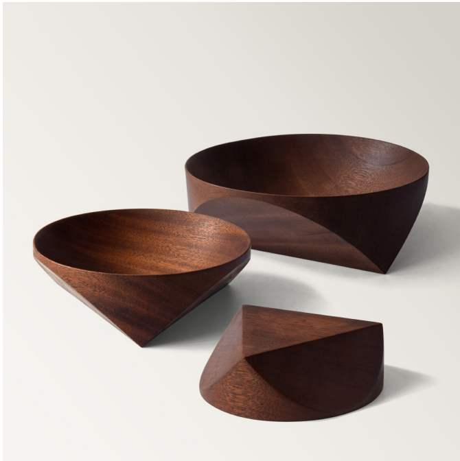
bottom: 150mm mahogany, middle: 200mm mahogany